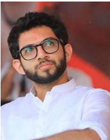
Environment Minister Hon. Shri Aditya Thackeray