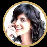
JASLEEN ROYAL SINGER, SONGWRITER & COMPOSER