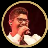
SHIVAM MAHADEVEN PLAYBACK SINGER